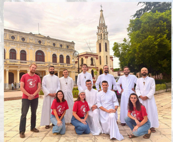
The Community and lay volunteers outside their parish in Placetás, Cuba

To learn more, visit: missioncuba.org/en