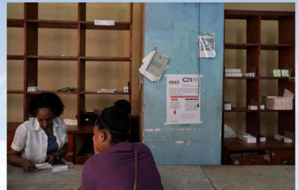
a typical pharmacy in Cuba, with mostly bare shelves

In Cuba, official pharmacies are almost empty. Medicines, when they can be found, circulate on the black market at prices far beyond the reach of most families. Faced with this dramatic reality, it is not uncommon for serious illnesses — including some cancers — to be treated with simple plants or a few aspirin tablets. In this context, the parish pharmacies of the Community of St. Martin on the island have become vital places for the local population. They survive solely thanks to donations sent from France and the United States, transported by volunteers and friends of the Mission during their trips. Each box of medicine that arrives represents a real treasure for the sick and their families. In Placetás (their main parish), the parish pharmacy now manages a database of over 3,000 patients. Since 2024, it has benefited from new stock management software, allowing for more rigorous tracking and organization. Thanks to these tools and to the generosity of donors, a more efficient and fair service can be offered — even though the needs remain enormous. You can help our joint efforts by providing to our parish St. Martin Society, or visiting their website and contributing directly.