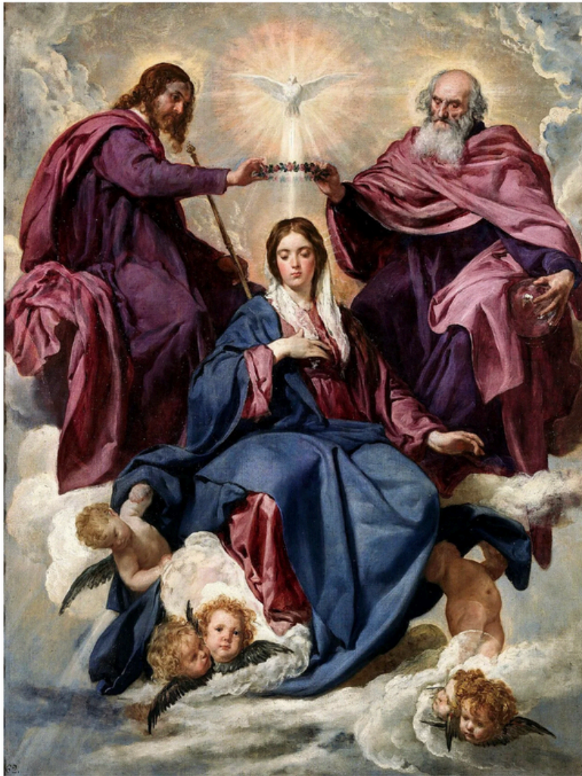
Diego Velázquez, The Coronation of the Virgin , 1636

-from Venerable Fulton J. Sheen's "Life of Christ"