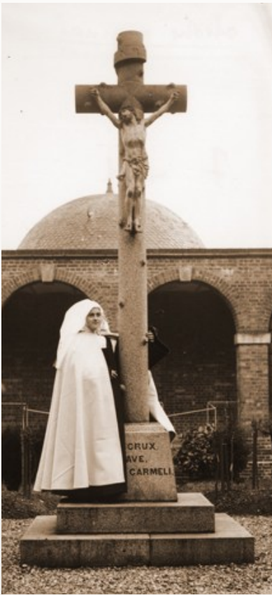
Photograph of St. Theresa as a novice embracing the Cross. She always had a great devotion to the Holy Cross of Jesus, especially during her great trial of faith.

- Meditation on The Precious and Life-giving Cross of Christ by St. Theodore the Studite