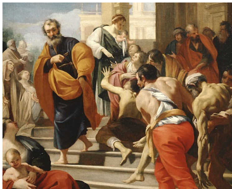
“They even carried the sick out into the streets and laid them on cots and mats so that when Peter came by, at least his shadow might fall on one or another of them.” - Acts 5: 15