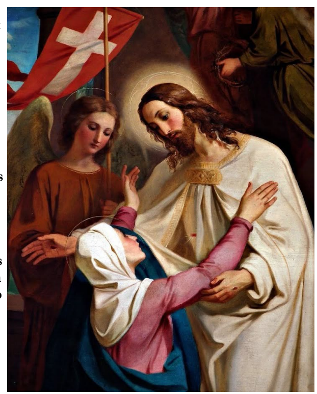
- from Meditations on the Mysteries of the Rosary by Ven. Fulton J. Sheen

The Resurrection begins to affect our lives the day of Baptism. When baptized, we are plunged into the waters as if "buried in the sepulcher to sin and death; emerging from the waters clothed with grace as the principle of Divine Love, we are like the Christ rising from the tomb in the glory of the Resurrection." Though we are risen in spirit with Christ, so that "our conversation is in heaven," our bodies will not share that glory until our own final resurrection. In the meantime our body must be crucified with Christ's that we may rise with Christ. On the road to Emmaus on Easter Sunday, our Lord said to His disciples, "Was it not to be expected that the Christ should undergo these sufferings, and enter so into His glory?" But if that be the law of Innocence, then how shall we, the guilty, hope to escape from it?