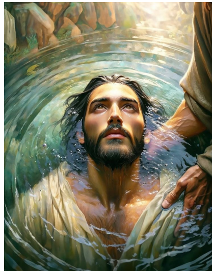
- Genesis 1:2

The voice of the LORD is over the waters, the LORD, over vast waters.